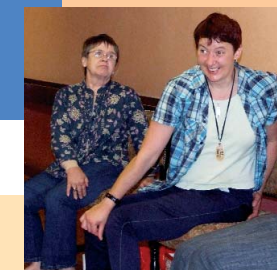
A yoga class at Paul's Place