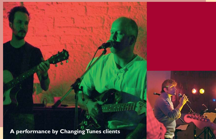
A performance by Changing Tunes clients